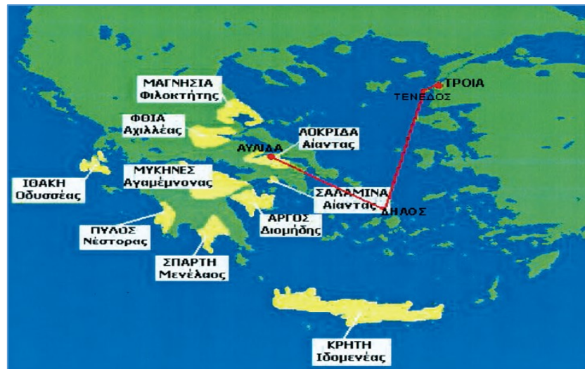
Figure 6. Οι περιοχές απ' όπου ξεκίνησαν οι Αχαιοί και η πορεία τους από την Αυλίδα προς την Τροία. (The regions from which Achaeans began their journey from Avlida to Troy. Textbook, p.65)

In Figure 6, various regions are endowed with the same status as the starting point of heroes. The heroes explicitly combine different regions under a single frame. The consistent form of tags marking heroes' names the place names show that the map is not just indicating the locations.