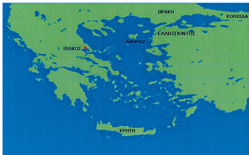
Figure 5. Η Αργοναυτική εκστρατεία. (The Argonaut Campaign, workbook, p.44)

The following maps respectively show the regions concerned with Argonaut Campaign (Figure 5) and Trojan War (Figure 6). Although the time is different, the maps do not change. Jason and Achilles take similar positions in building up the framework of united Greece.