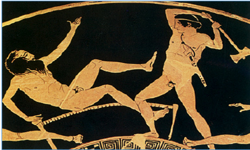
Figure 2. Θησέας και Προκρούστης. (Theseus and Procrustes. Textbook, p.44)

Although both pictures represent the hero's triumph, the focus is on the process not the struggle. In the (Fig. X), the wildly roaring lion is larger than Hercules, who seems to be struggling to overcome his opponent. In the second picture, Procrustes actively avoids Theseus' attack. This scene makes viewers imagine the critical moment of Theseus and his audacity and resolution.