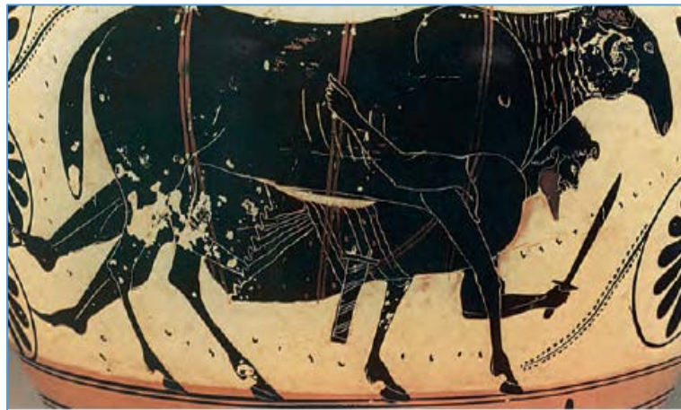
Figure 3. Ο Οδυσσέας ξεφεύγει από τη σπηλιά του Πολύφημου, δεμένος κάτω από την κοιλιά του κριαριού. (Odysseus escapes from Polyphemus' cave, bound beneath the belly of a ram. Textbook, p. 84)

Although both pictures represent the hero's triumph, the focus is on the process not the struggle. In the (Fig. X), the wildly roaring lion is larger than Hercules, who seems to be struggling to overcome his opponent. In the second picture, Procrustes actively avoids Theseus' attack. This scene makes viewers imagine the critical moment of Theseus and his audacity and resolution.