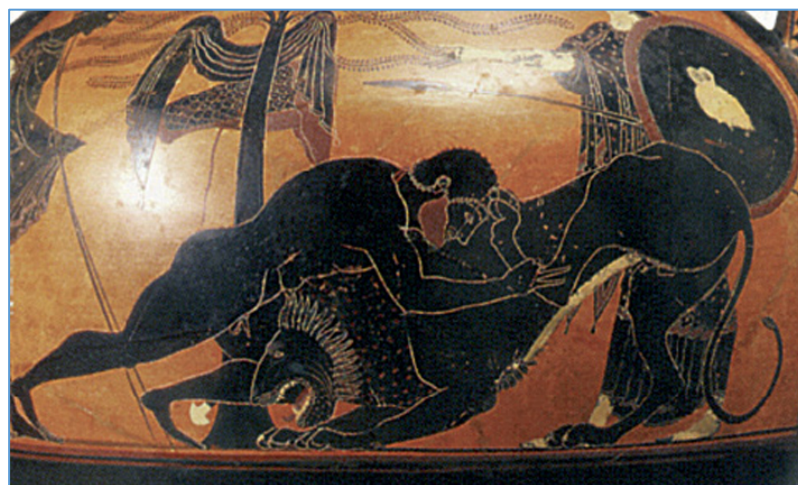
Figure 1. Ο Ηρακλής παλεύει με το λιοντάρι της Νεμέας. (Hercules fights Nemea's lion. Textbook, p.33)

Pictures from ancient times are frequently used as visual materials,. Pictures scribed on ancient potteries describe the heroes' struggles vividly, leading pupils to respect them. The pictures emphasize the heroes' braveness and patience. In (Fig. 1.0) the most cutthroat moment of Hercules's fight with the Nemean lion is described. In the second picture, the very moment of Theseus' defeating Procrustes is captured.