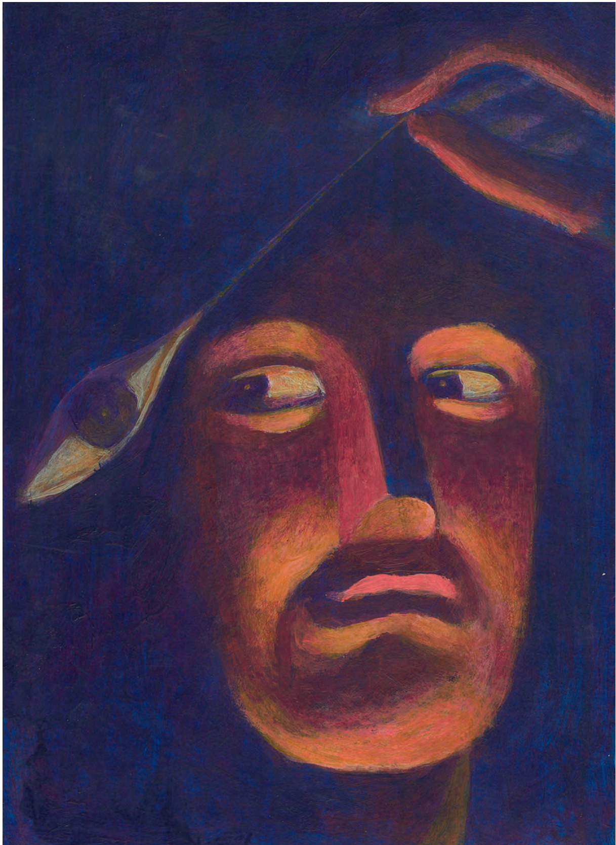
Paco de la Torre. Ocularpendulum B , 2017. Acrylic on paper, 20×28.8 cm.