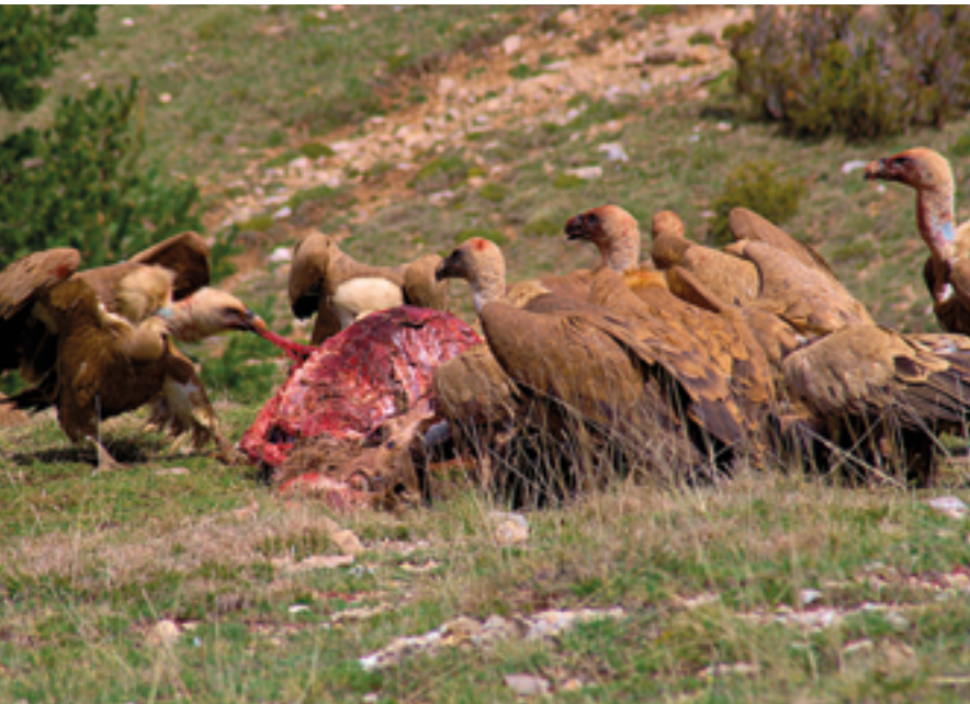
Merio Modesto Mata - Wikipedia

In species with scavenging food habits, such as the griffon vulture ( Gyps fulvus ), direct ingestion of antibiotic residues and antibiotic resistant bacteria from livestock carrion or infected carcasses of wildlife could be a source of infection.