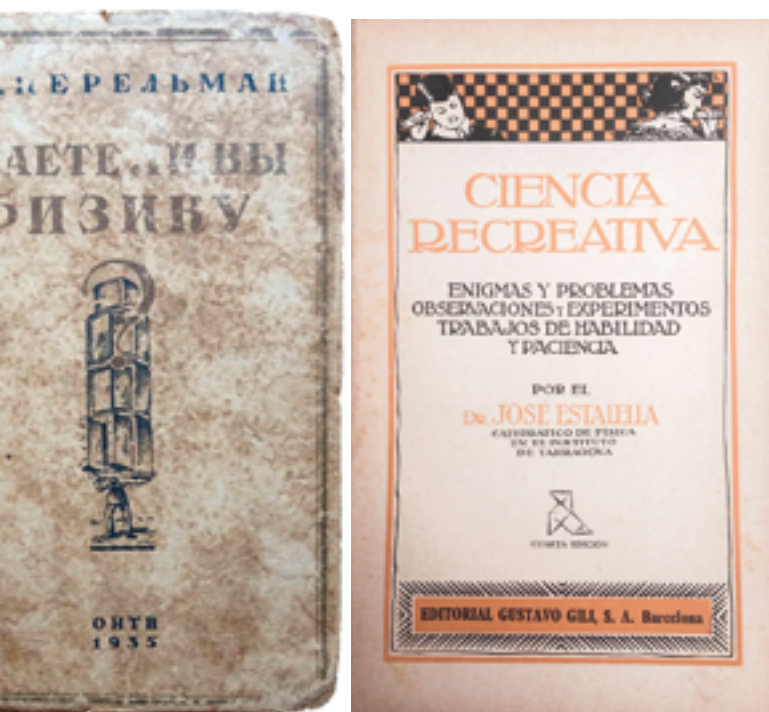
Figure 4. On the left, the cover of Physics for entertainment by Yakov Perelman, in the Russian edition from 1935. On the right, the cover of Ciencia recreativa , by José Estallella.