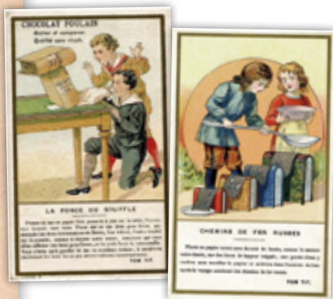
Figure 3. On the left, the cover of La science amusante (Deuxième série) , published in 1892. On the right, collectable cards showing two children carrying out experiments from La science amusante .

Científicas) of which he became director in 1921. However, a few months later he had to resign because of his father was ill and so he joined the Secondary School of Tarragona. From 1932 until his death, he was director of the Institut-Escola de la Generalitat de Catalunya, located in Ciutadella Park in Barcelona.