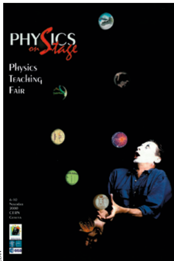
Figure 5. Poster for the first Physics on Stage competition, held at CERN from 6 to 11 November 2000.