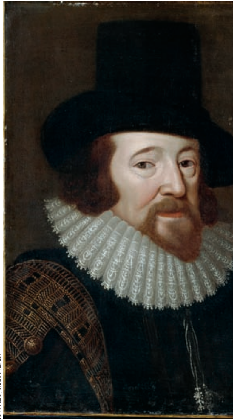
Portrait Gallery of Dulwich, London

The interest in identifying scientific knowledge in order to distinguish it from other kinds of knowledge – like religious or metaphysical knowledge –, reached its peak in the 1920s and 1930s, with the defence of science by the logical positivists of the Vienna Circle. Science had to selflessly search for the truth and be responsible for the production of objective knowledge, verified by facts. Scientific knowledge had to be universal and independent from the context in which it was formulated. This could only be achieved through the application of a special and distinctive method named the scientific method .