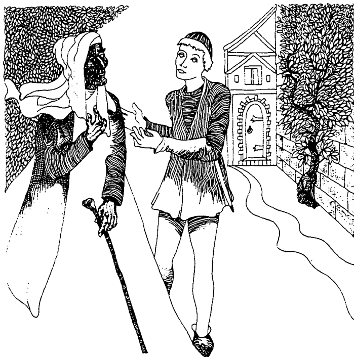
Sempronio and Celestina en route to Calisto's house, Act I. Barcelona: Lumen, 1988. Illustration by Bartolomé Liarte

The verb is not used reflexively in Colombia and Chile according to my data. Others with larger collections of dictionaries from the Spanish-speaking world probably will be able to provide data on other derivatives or uses of celestina , celestino , celestinaje and celestinear . Others with good access to Portuguese materials might see if there are derivatives in that language. The Dicionário da língua portuguesa elaborado por Antenor Nascentes (1961) defines celestina , a feminine noun, as "alcoviteira" (De Celestina, nome de uma personagem da Tragicomédia de Calixto e Melibéa ). The Codil Dicionário prático (Sao Paulo, 1965; I:313) provides the same meaning for celestina , but labels it a figurative meaning.