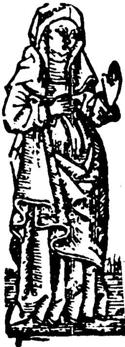
Figurita. J. Cromberger (Sevilla 1525).