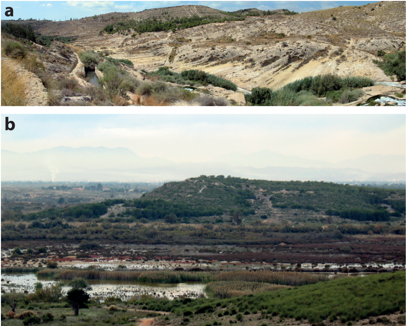
Figure 2. Views from the studies areas. a) Panoramic view of the Margas de Torremendo Formation in Elche reservoir surroundings. b) Clot de Galvany Municipal Natural Park Wetland.

big cities. Most concerning are urban growth very close to Clot de Galvany and systematic plundering in Elche reservoir surroundings.