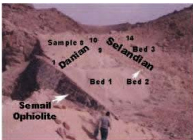
Figure 2. View of the Paleocene sediments (Danian-Selandian transition, Mundassa Member of the Muthaymimah Formation) which nonconformably overly the obducted pre-Maastrichtian Semail Ophiolite.

the other hand, Speijer (2003) noted that the D/S transition in Egypt is marked by a black shale bed rich in organic carbon and fish remains, strongly dominated by anomalous foraminiferal assemblages, and defined as the “ Neo-duwi event”, while in Tunisia, a palaeoenvironmental change is recorded during the same interval although it was not marked by a black shale bed. In the section presented in this study, J. Mundassa in UAE, neither marked black shale bed in this interval nor Neoeponides duwi are recorded. In total 26 agglutinated benthic foraminiferal species are recorded, 21 of which are illustrated in Figure 4 from the D/S transition (Early-Middle Paleocene, P1a-P3) of the shaley marl succession in J. Mundassa. Based on the planktic foraminiferal zonation the duration of the hiatus at the Cretaceous/Paleogene (K/P) boundary includes the two earliest Danian biozones (P0 and Pa, about 0.02 Ma, Fig. 2).