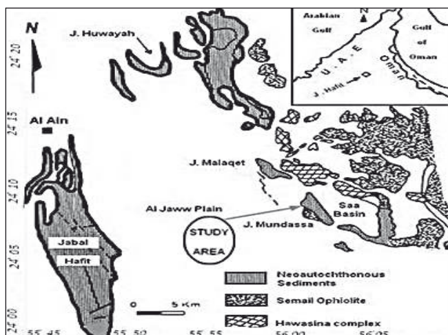
Figure 1. Location map of the study section at Jabal Mundassa, Al Ain area, UAE.